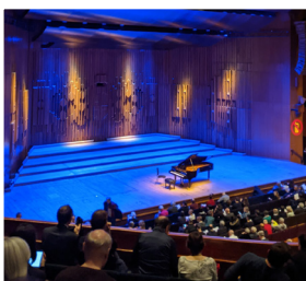
LIVE PRODUCTION WORSHIP RACING