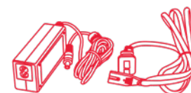
Power Adapter & Cable

At ADIA Imaging , innovation is key to crafting our tried and tested quality imaging solutions. We strive to raise the bar by engineering and manufacturing cutting edge cameras and converters. From concept to reality, ADIA Imaging meticulously creates products that are applicable to various solutions, effective for the global user.